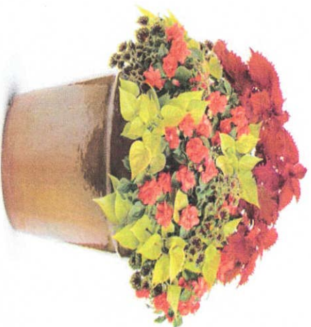
12"-$40 or 15"-$50 Patio Pot -Shade

Any questions contact Barb Kaeter (320)250-8297