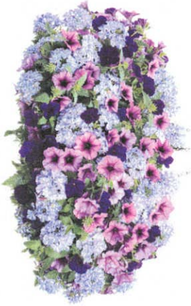
Combo F $40 **Shade