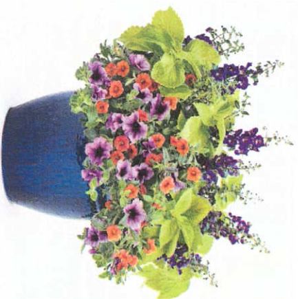
12"-$40 or 15"-$50 Patio Pot-Sun

Patio tomatoes will be in a 12" pot with a cage. You may choose from a cherry or regular tomato.